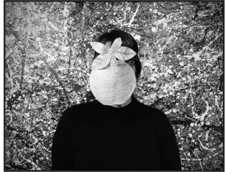
Example of project done at the Art Center.