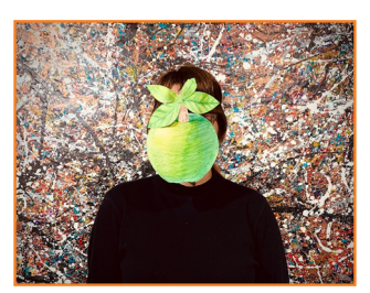
Example of project done at the Art Center.