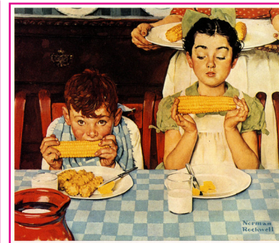
Norman Rockwell, Who's Having More Fun? (Kids Eating Corn), 1939, Norman Rockwell Museum Stockbridge, Mass.

2nd Jose Guadalupe Posada, 1852 3rd Norman Rockwell, 1894 3rd Gillian Ayres, 1930 4th Manuel Alvarez Bravo, 1902 8th Franz Marc, 1884 13th Grant Wood, 1892 20th Ansel Adams, 1902 24th Winslow Homer 25th Pierre Auguste Renoir, 1841 26th Honore Daumier, 1808