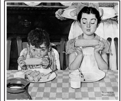
Norman Rockwell, Who's Having More Fun? (Kids Eating Corn), 1939, Norman Rockwell Museum Stockbridge, Mass.