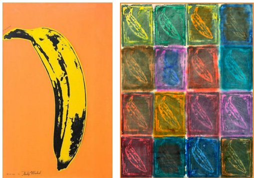
Left: Andy Warhol, Banana , 1967, silkscreen

View full tutorial online at quincycartcenter.org .