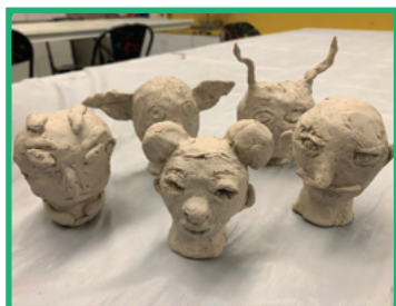
Clay heads made during Chaddock workshop