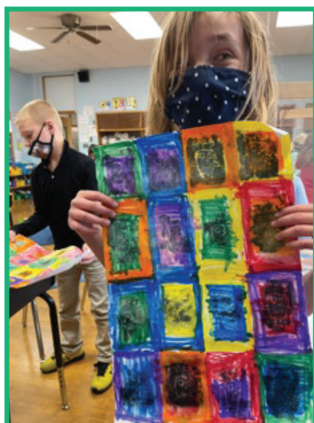
Student with artwork made during the Andy Warhol smART Kids Program

large-scale and explored the use of space on the page, and students were given a Gallery lesson plan where they could go onto quincyartcenter.org , explore our online exhibits, and learn how to view and talk about works of art. The smART Kids program is a grant-funded program, with generous contribution by the Tracy Family Foundation. The program has helped provide support for teachers to incorporate visual art education into their classroom curriculum for over the past decade. Art Education for K-3rd grade is not a requirement for the state of Illinois, however, it is clear through the success of this program the need and desire for art education from teachers and students alike. This year's lesson plans will introduce students to the importance of craftsmanship in the world of art, how to use lines to help create depth, texture, and story, as well as new exhibits for the students to explore. We are excited at the creative challenges this past year has brought us as the possibilities for this program continue to grow.