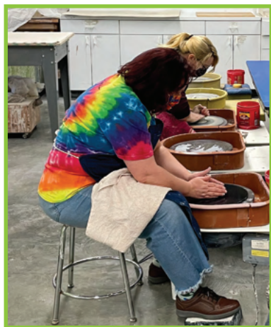
Students using the wheels in The Art Center studios

Never thrown on the wheel before? This is the class for you! Get an introduction to working on the potters wheel. This class will focus on understanding the medium of clay and critical analysis of the process in order to build artistic skills. Maximum of 8 Students.