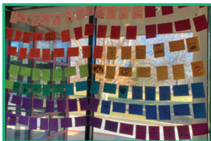
Pride in the Park Project, currently on display in The Art Center lobby

Pride in the Park - The Art Center was grateful to be a part of the first annual Pride in the Park event at Clat Adams Park on September 19th. Our responsive community project helped create a banner of love and encouragement that everyone in the community needs, as well as, hear the needs and hopes of our LGBTQIA+ community. This community banner is currently on view in The Art Center lobby.